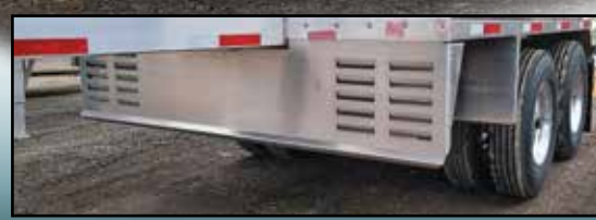
NEW - Innovative aero diffuser.