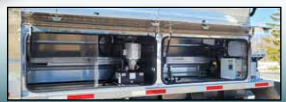
Gone are hydraulic valving controls. New tidy electronic controls cabinets combine with partitioned storage bays.

Optional Wireless Remotes: Choose from fully programmable full function Android Tablet or traditional OMNEX Remote.